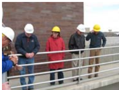
CWWUC members pondering the secondary treatment process at a past tour of Littleton Englewood's new facilities.

Plant effluent is discharged to the South Platte River. The South Platte is the major watershed in the Denver Metro region. The watershed is a combination of pristine mountain areas, highly urbanized areas, and intense agricultural used lands. The river itself is a tightly controlled stream with water rights usually dictating the flow through the Denver area.