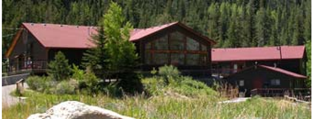
Easter Seals Rocky Mountain Village in Empire, Colorado provides a get-away for kids

Easter Seals provides exceptional services, education, outreach, and advocacy so that people living with autism and other disabilities can live, learn, work and play in our communities.